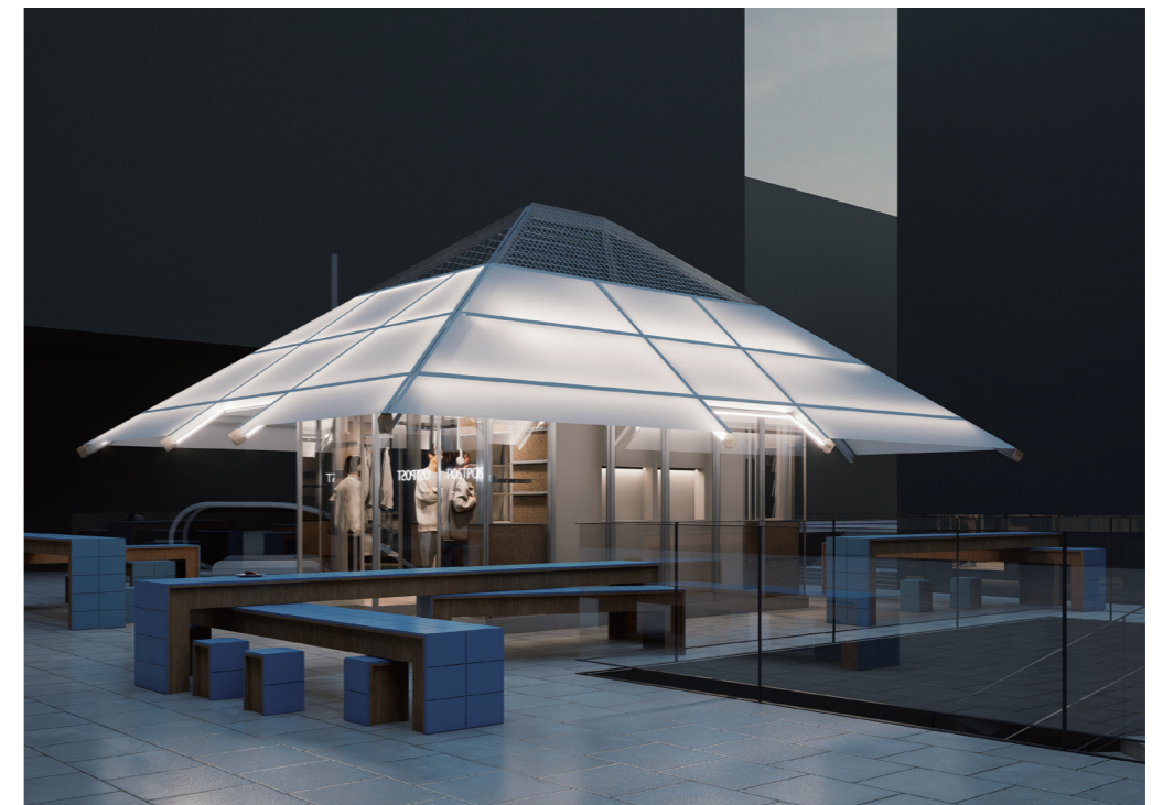
Brazilian Pavilion Expo Dubai 2020 / MMBB Arquitetos + Ben-Avid + JPG.ARQ